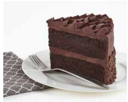
Dark Devil's Food